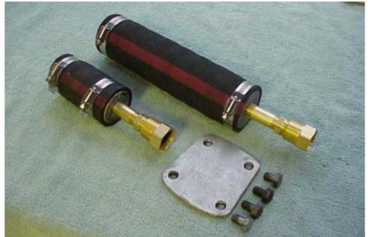
Shown above are the two adapters and the water pump blanking plate. The long hose is the upper (larger diameter) hose. The short hose is the lower (smaller diameter) hose.

To back flush the engine, disconnect the radiator from the engine and install the two adapters to the engine. The large adapter is connected to the water outlet on top of the head. The small adapter is attached to the water inlet on the left side of the block. It is also suggested that the water pump be removed and a blanking plate be installed over the opening in the head. Connect a garden hose from the hot water spigot to the large adapter on top of the head. Connect a second hose to the smaller adapter on the side of the block and lead it off to a drain. Begin the back flushing. You can also start the engine up to add some vibration if desired. The hot water will not only aid in flushing the engine, it will also prevent the possibility of cracking the block with the use of cold water if you run the engine.