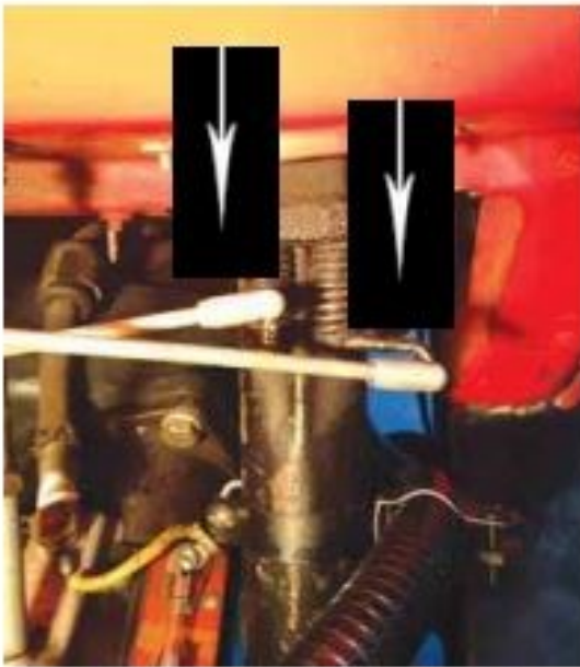
Remove throttle and spark control linkage