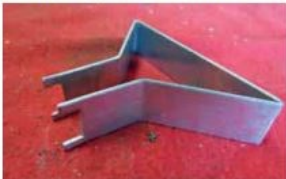
Spider Install Tool