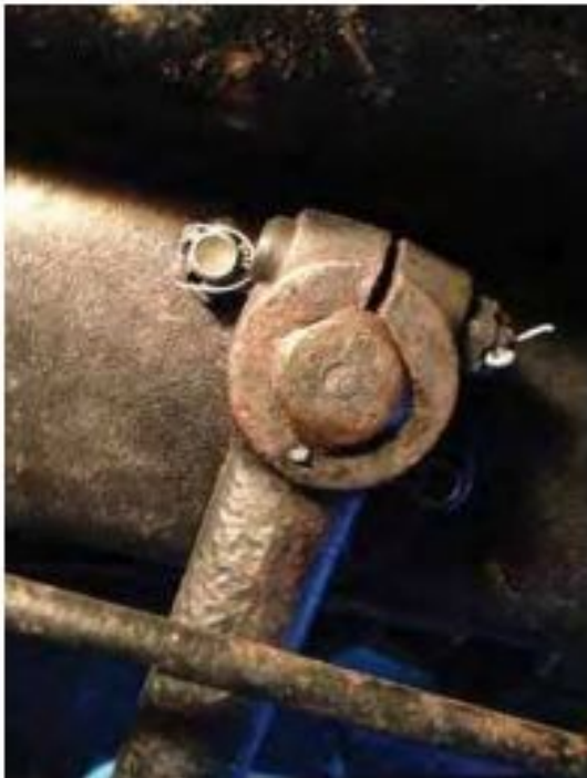
Remove cotter pin and castle nut from the pitman arm and remove it and then the two sector housing to frame castle nuts and bolts