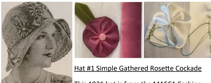
Hat #1 Simple Gathered Rosette Cockade

When you glue something onto a hat, even with low-temp glue, you risk ruining the hat for future use. If you can remove the hatband or embellishments, it will probably leave some sort of mark on the hat itself, or hole, which has to be covered up. Can't thread a needle? There are internet videos and reference books galore at your local public library. It's never too late to learn a new skill. Why settle for a hat that "can pass for" vintage, when you can make your hat yell, "I Look Vintage!" loud and clear? It just takes some ribbon, time, and a bit of experimentation.