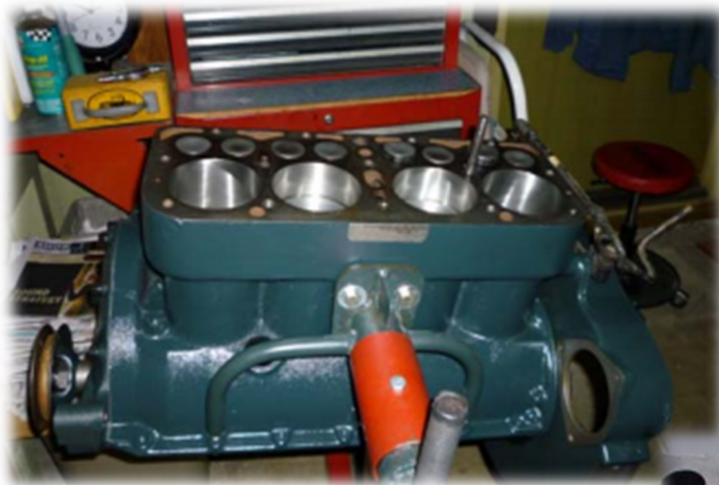
The #8 stud sits right next to the narrow area between #3 and #4 cylinder.

The best solution is to remove the clamp completely from the armored cable and install a spacer under the nut at the #8 stud to properly space it. Torque all the head bolts down to the proper specification in sequence, and don't fool with them when out on the road. The #8 stud can also be replaced with a standard length stud as used in the other stud positions.