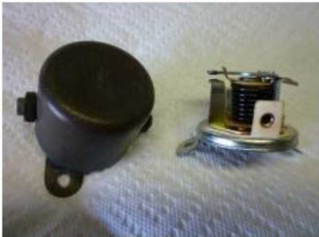
Original quality Ford cut-out on the left. Insides of poor quality reproduction on the right

The Model A Ford generator cut-out is the mysterious little device that sits on top of the generator. There is a switch inside that is either open or closed. Its very simple purpose is to connect and disconnect the generator from the battery and the rest of the electrical circuit. In the days before there were generator regulator circuits the cut-out was a means to connect the generator to the car's electrical circuit when the engine was running, and disconnect it when the engine was not running.