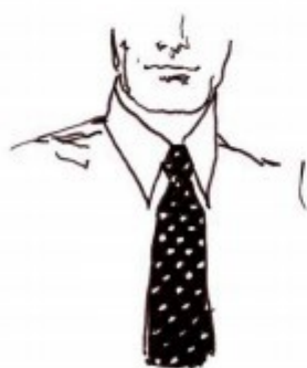
Plain collar with medium-length points, basic fashion 1920s and 1930s