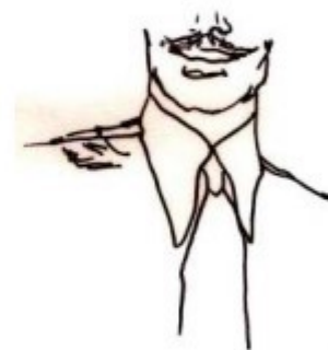
The Barrymore collar 4 1/2 - 5 inches long 1928 thru 1930's