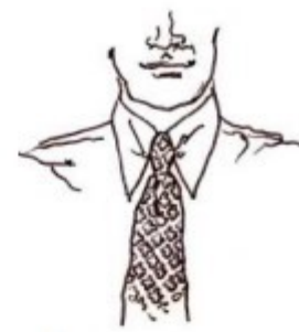
Pinned collar, worn with pins that went through the collar and snapped at the points 1928-mid-thirties