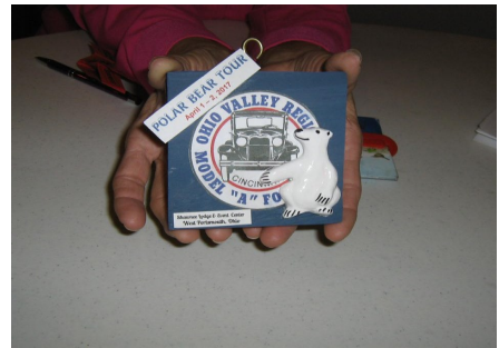
2017 April Polar Bear Tour Award