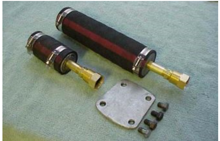
Shown above are the two adapters and the water pump blanking plate. The long hose is the upper (larger diameter) hose. The short hose is the lower (smaller diameter) hose.

To back flush the engine, disconnect the radiator from the engine and install the two adapters to the engine. The large adapter is connected to the water outlet on top of the head. The small adapter is attached to the water inlet on the left side of the block. It is also suggested that the water pump be removed and a blanking plate be installed over the opening in the head. Connect a garden hose from the hot water spigot to the large adapter on top of the head. Connect a second hose to the smaller adapter on the side of the block and lead it off to a drain. Begin the back flushing. You can also start the engine up to add some vibration if desired. The hot water will not only aid in flushing the engine, it will also prevent the possibility of cracking the block with the use of cold water if you run the engine.