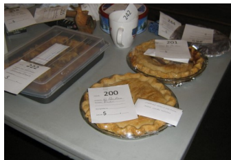
Baked goods were a big hit at the annual auction