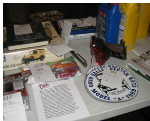
Even more Model A parts and accessories