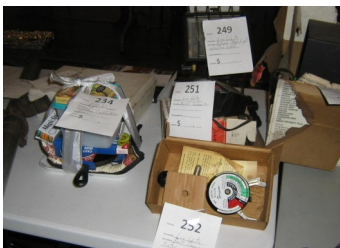
Model A parts and accessories were also available in the auction