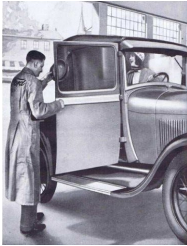
Ford Service Bulletins emphasized service, shop cleanliness, and the appearance of the employees. This illustration, from the July 1928 Bulletin, shows the serviceman in a shop coat, with the Ford Logo, shoes polished, and cap in hand.

Major oil companies took note and began to standardize their stations, making them visually appealing to the motorist. Not only did the station need to look good, the service employees needed to project honesty, integrity, reliability and quality. What better way to do that than through the clothing they wore?