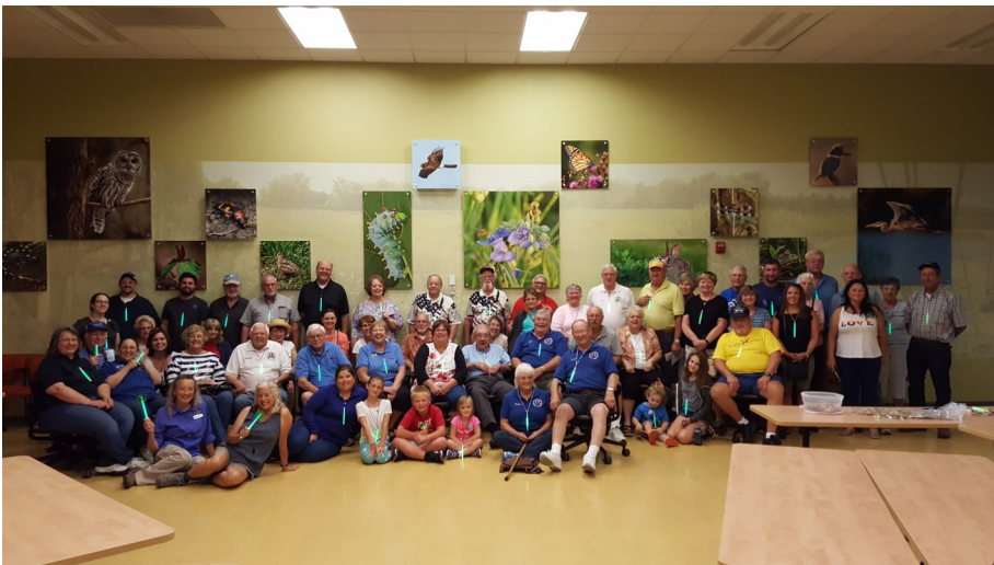
What a great time at the Fernald Preserve in Ross Ohio!