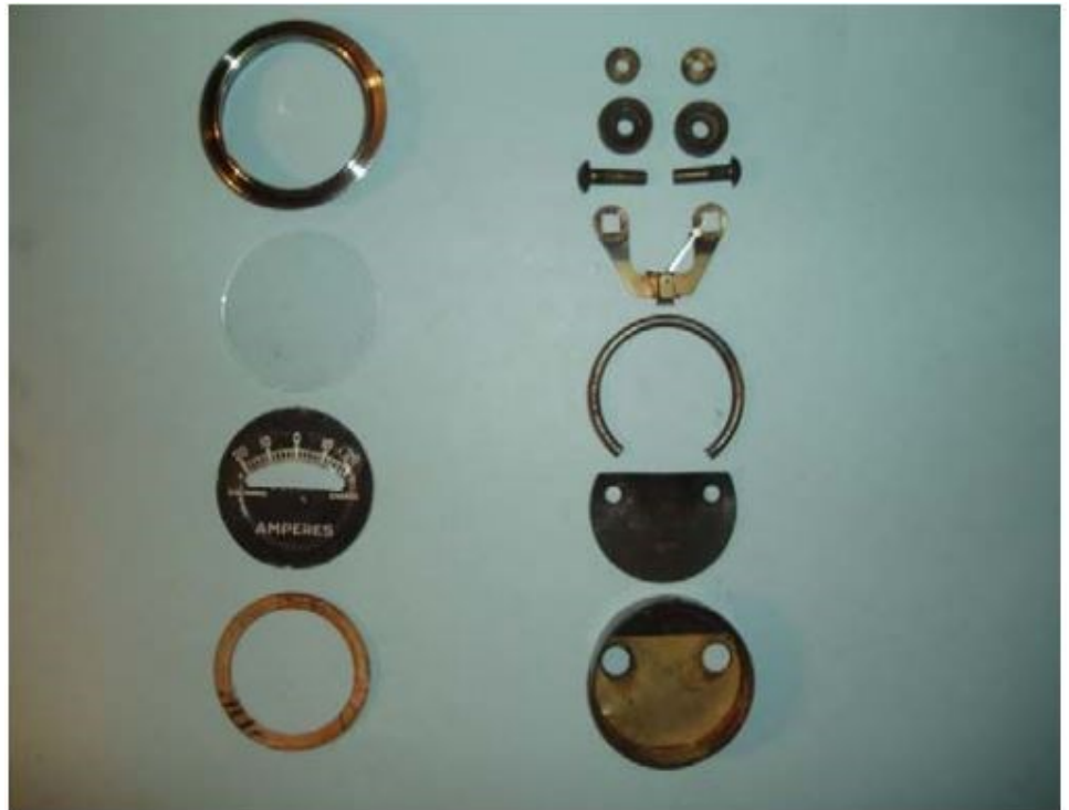
The Model A ammeter is a fairly simple device.

The ammeter is telling you it is time to have the battery checked.