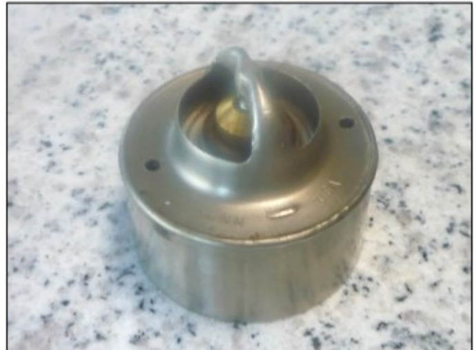
An automotive thermostat modified for use with a Model A. Note the skirt welded to the base to prevent it from tumbling in the water outlet hose. Two small holes are drilled into the base for a small amount of water flow when the thermostat is closed.

It may be just a theory, but it may have some merit. After experiencing a costly engine failure I decided to remove the thermostat from my Victoria. I can't see where it can do any harm, after all Henry produced over five million Model A's that roamed the planet for decades without a thermostat.