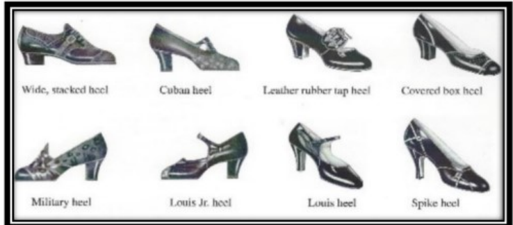
A sampling of Model A era shoe heels provided by MAFCA's Fashion Guidelines

Its tall, rectangular heel is significantly dissimilar to the Model A era heels illustrated in the below figure found in the MAFCA Fashion Guidelines. While the top portion of this pair conforms to the era's T-Strap appearance, wearing them in a competitive venue will result in points lost. If you purchase a pair of modern shoes with an era look but without the era heel, wearing them for fun is always an option.