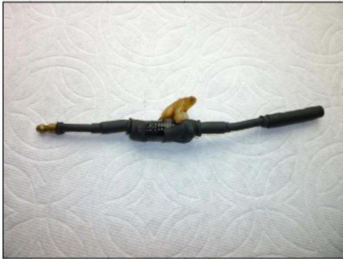
An ahooguh dropping resistor that burned out

One consideration is the conversion of the ahooguh horn to be able to operate with 12 volts. In the past most people installed a dropping resistor that can be obtained from any of the suppliers. This however is not always the perfect solution. The dropping resistor has to be a very low ohm value and a high wattage value. If the ohm value is not correct the horn will sound sick. If the wattage value is not correct the resistor will burn out. Many of the dropping resistors on the market today cannot handle the power requirement and will burn out with repeated use of the ahooguh.