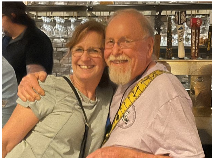
It was a great time just spending time with my dad.