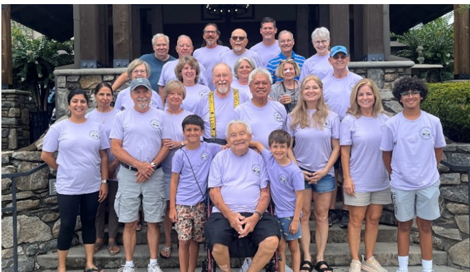
With custom shirts for the event, the club was hard to miss!

a short hike, shopped in downtown Asheville, and found plenty of breweries!