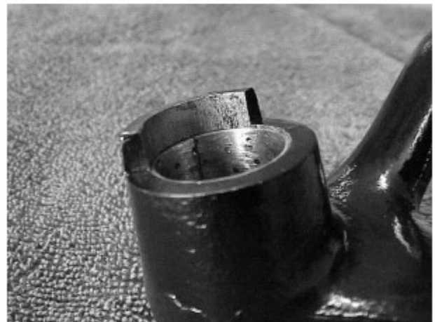
Brake pedal stops